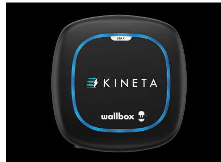
WALL BOX CHARGER (AC 11kW)