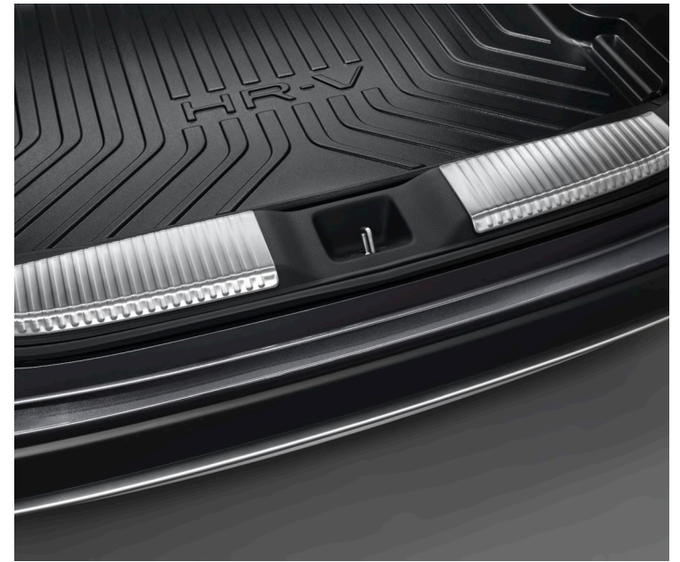
REAR PANEL LINING COVER