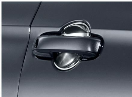
DOOR HANDLE PROTECTOR